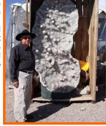
Huge drusy quartz specimen from Brazil on exhibit at Tucson

Show® sponsored by the Tucson Gem & Mineral Society. The show is held at the Tucson Convention Center, February 9-12, 2023. Lapidaries and collectors can find many agates, opals, and quartz specimens at that show, as well as spread throughout all the gem and mineral shows in the Tucson 2023 Showcase.